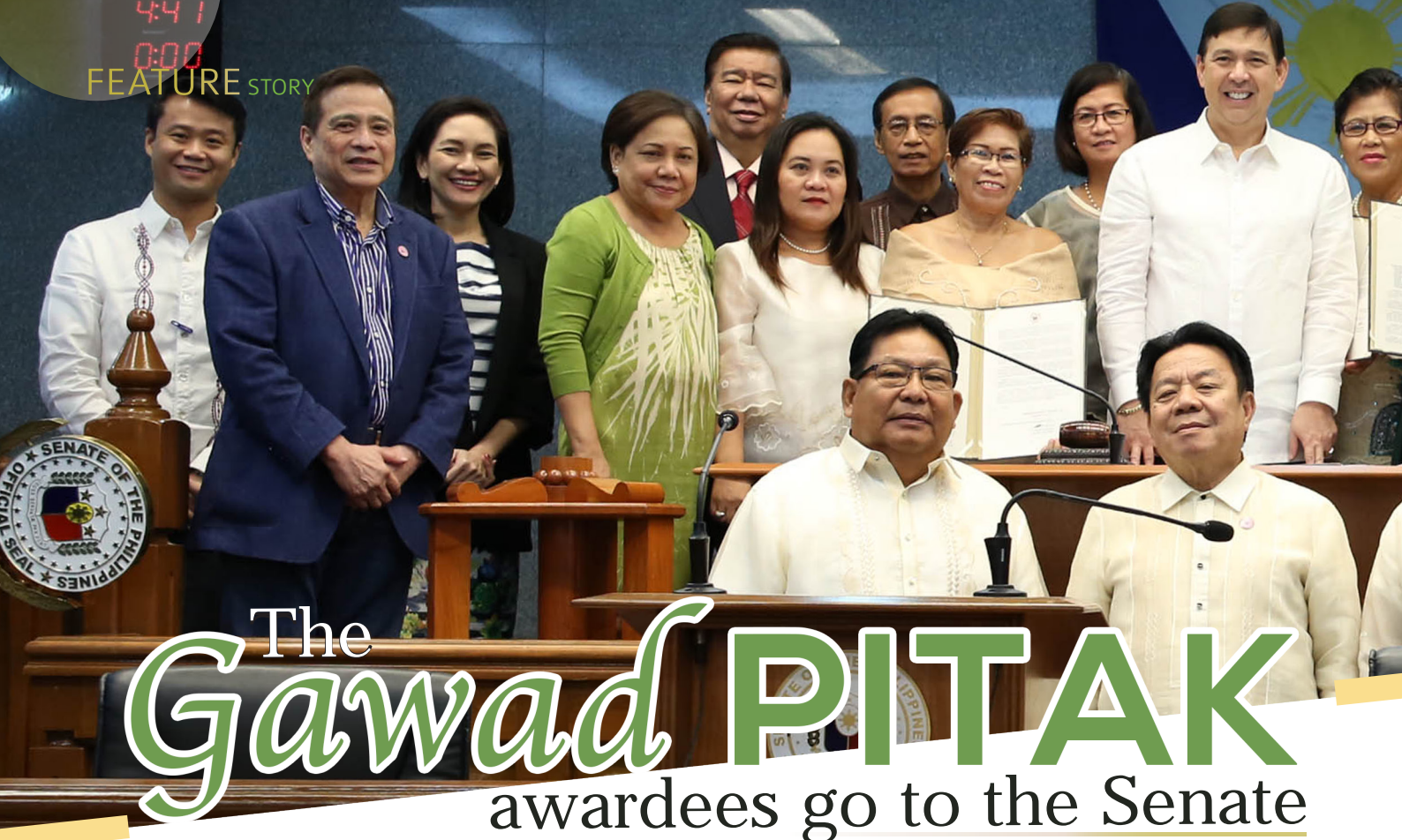
Members of the Senate of the Philippines with officials from LANDBANK and 2017 Gawad PITAK winners during the August 15 event.