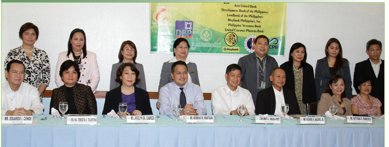
Key officials from accredited banks LANDBANK, Asia United Bank, Development Bank of the Philippines, Maybank, Philippine Veterans Bank and United Coconut Planters Bank were on hand to seal the agreement for PVAO's pension servicing system at Camp Aguinaldo, Quezon City.

The Philippine Veterans Affairs Office (PVAO) recently tapped LANDBANK as one of its accredited banks for a system that aims to provide PVAO veterans with a fast and secure delivery scheme for their pension funds through electronic transfer. The facility is called Direct Remittance Pension Servicing System (DRPSS).